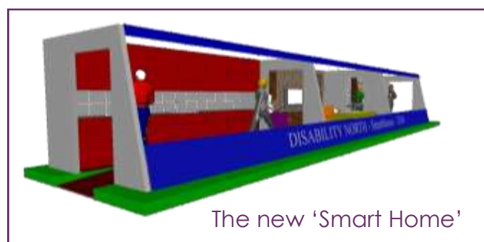
The new 'Smart Home'

2010 is the 20th anniversary of DNEX and we have some exciting new initiatives planned for DNEX including Just for Kids! which is a brand new section of the exhibition within the main hall dedicated to children. Another new initiative is our new 'Smart Home' 2010 (please find an artists impression below).